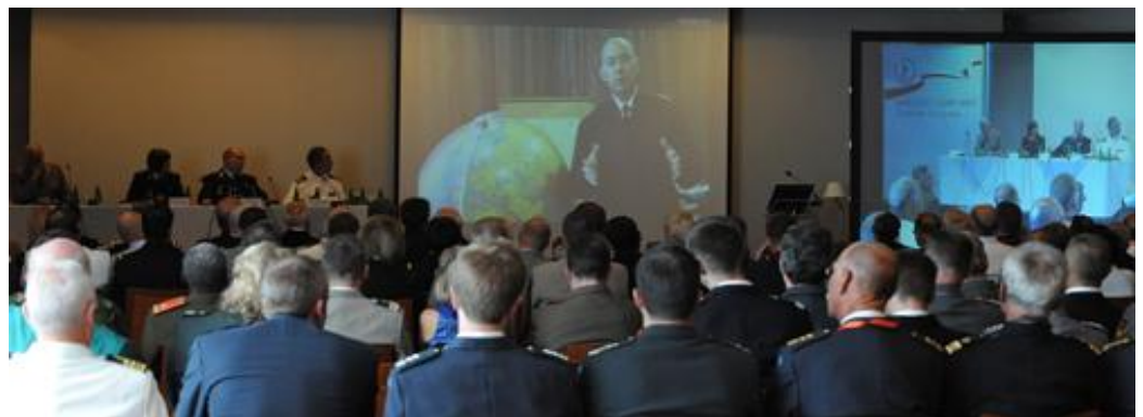
SACEUR addressed the CIOR community at the beginning of the Symposium.

The CIOR community discussed furthermore on several panels the transition in Afghanistan; the fight against piracy; and the cyber warfare. More than several hundred delegates and reserve officers from more than 36 countries had the chance to discuss the subject with top speakers from several military institutions, NGO's, Universities and Think-Tank's.