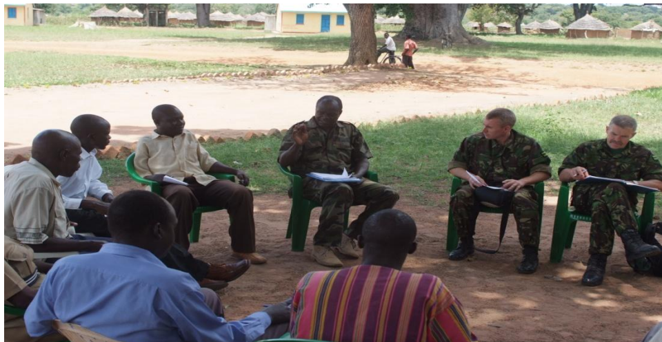
UK MSSG team with Ugandan Military attachment, meeting with Ugandan village officials.