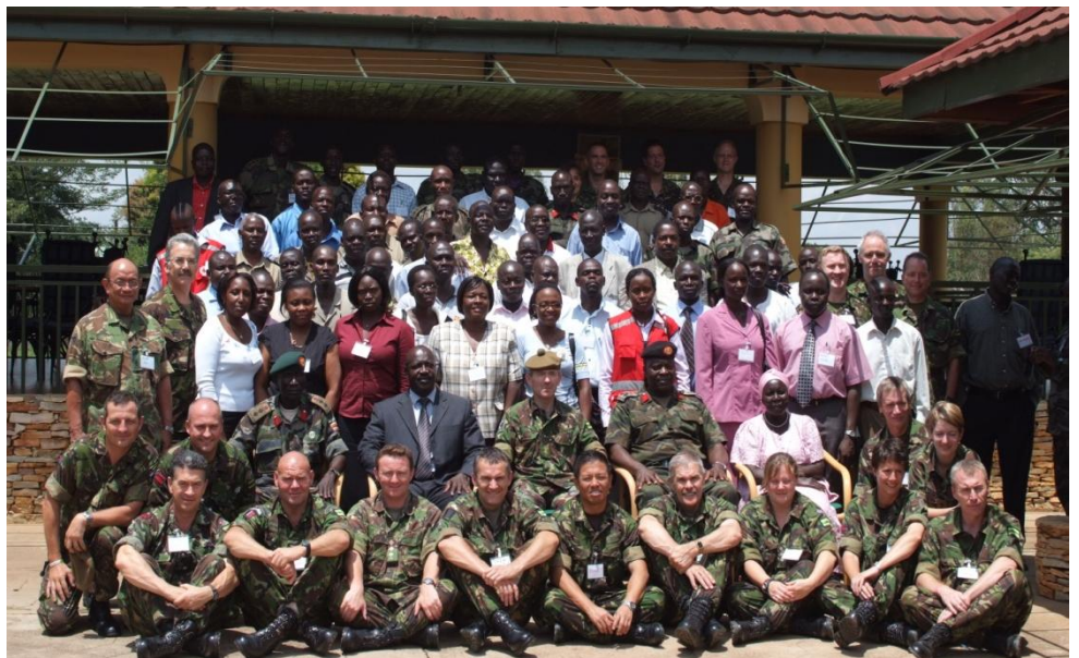
UK MSSG team which facilitated a disaster management workshop attended by Ugandan government officials, senior military, local government officials, emergency services and NGOs.

The unique aspect of EX CB which has been progressively developed over the years is the delivery of “real” product to the host nation. For example; the facilitation of a disaster management workshop for several districts in Uganda; a region prone to drought and famine, amongst other natural disasters. Real product also included the facilitation of an inaugural planning meeting in Uganda’s capital city of Kampala, of a newly formed Uganda Government Flood Task Force. This task force specifically requested that the Group help them through the initial stages of planning for the response to an impending flood. The final “real” product from the exercise was a presentation and final report of the Groups’ key findings and recommendations in relation to the Government of Uganda’s disaster response capability, presented to the Government Minister and staff responsible for disaster management.